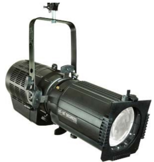
PHX3.5 30-55 Degree Zoom

These new and innovative options are what makes the PHX LED Zoom Spot ideal for theaters, special events, television studios, or wherever superior, energy efficient lighting performance is required.