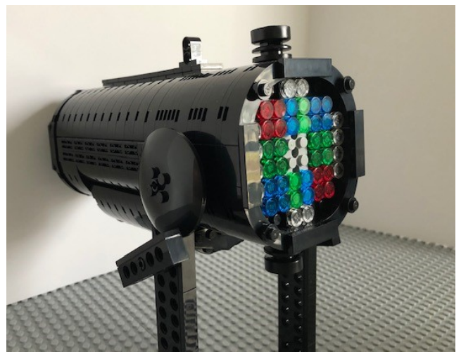
PHX 3 LEGO LED Profile Spot