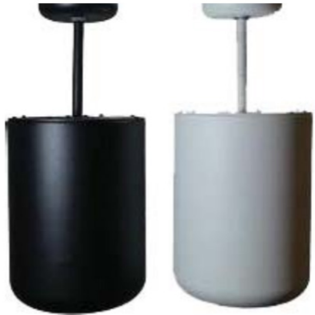
Chalice 50W LED Pendant

The 50W Pendant Chalice fixture is able to be controlled by your DMX Control console & architectural control system; for facilities without a DMX control system the 50W Pendant Chalice is also available in a mains dimmable fixture, or for easy retrofit to a current installation for energy savings.