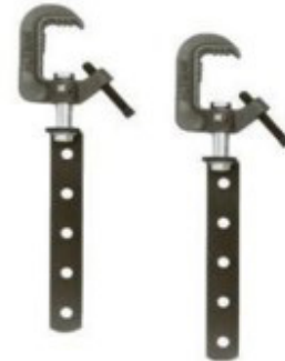
508 -10-inch Hanging Arms