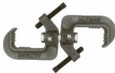
510-2 - Heavy Duty Malleable Iron back-to-back C-Clamp

Prior to ordering any pipe hardware please consult the Pipe Sizing table for the correct pipe sizing.