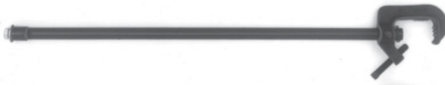
504A-24 - 24-Inch Extension Clamp