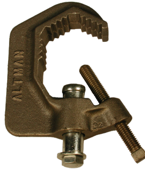
510-HD - Heavy Duty Malleable Iron C-Clamp