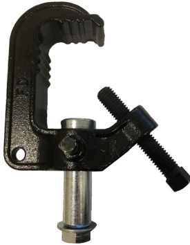
510 - Malleable Iron C-Clamp

C-Clamps function by affixing a bolt (the “shaft bolt”) to the hardware they are to hold in place, such as through the yoke of a lighting instrument, and securely fastening this bolt to the clamp shaft. The open end of the clamp is then placed over the pipe batten, and a bolt (the “clamp bolt”) is tightened to secure the c-clamp. To aide in your lighting focus Altman Lighting c-clamps also employ a pan screw (also known as a “grub bolt”), which when loosened will allow the clamp shaft to rotate, and therefore the fixture, to be rotated 360 degrees while maintaining a secure connection to the pipe batten.