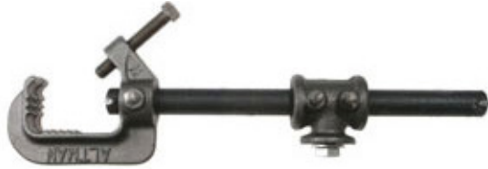
509-12-1 - 12-Inch Side Arm with one sliding TEE

Side arms are used to extend the mounting positions of luminaires or equipment from a vertical pipe or boom. It comprises a 510 or 510-HD pipe clamp on one end of a length of 1/2-inch pipe, with one or more sliding tees mounted to the pipe for attaching luminaires or equipment. Altman Lighting side arms have a baked black enamel finish.