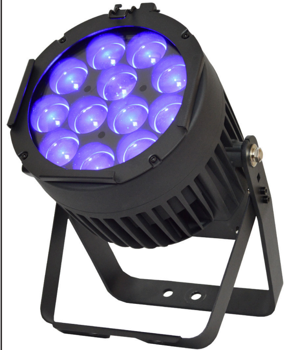
AIP200 RGBL Zoom Par

The motorized zoom produces a beam spread between 6.5° and 50° with built-in stops at five different set points ensuring precise beam spread repeatability. This zoom can be set from either the back panel and locked out, or directly from the console.